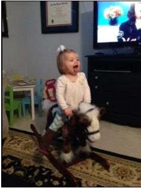
Lessie 1 yr